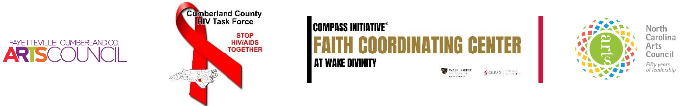
Exhibit Supported By

For more information, visit WeAreTheArts.com/stigma .