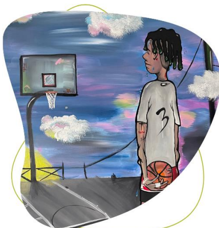
Easy Bucket Acrylic Paint & Oil Pen on Canvas 36x48 | $2,500