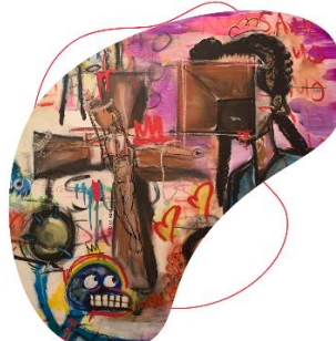
So Where Should We Start Acrylic Paint, Tempera Paint Stick & Oil Pen on Canvas 48x36 | $1,000