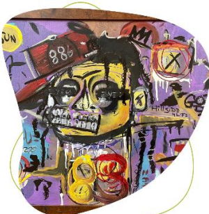
Bro Man Acrylic Paint & Oil Pen on Canvas 20x24 | $650