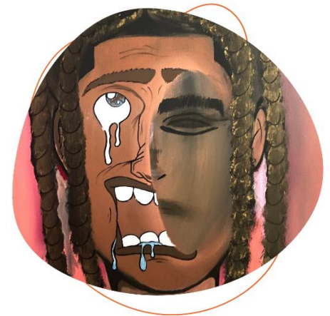
Jek and Hyde Acrylic Paint & Oil Pen on Canvas 24x30 | $250

Artist Andrew Brooks offers an “ARTlife” Art Experience featuring an aesthetically stimulating collection of over twenty large-scale acrylic and oil pen paintings on canvas ranging from 36” x 48” to 48” x 56” in size. His works are symbolic of the exaggerated, rhythmic stroke styles and the unconventional, dynamic application techniques used by the pioneers of the Urban Abstract Expressionism movement.