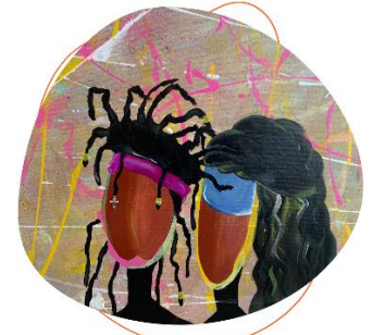
Thoth and Seshat Acrylic Paint & Oil Pen on Canvas 48x36 | $1,600